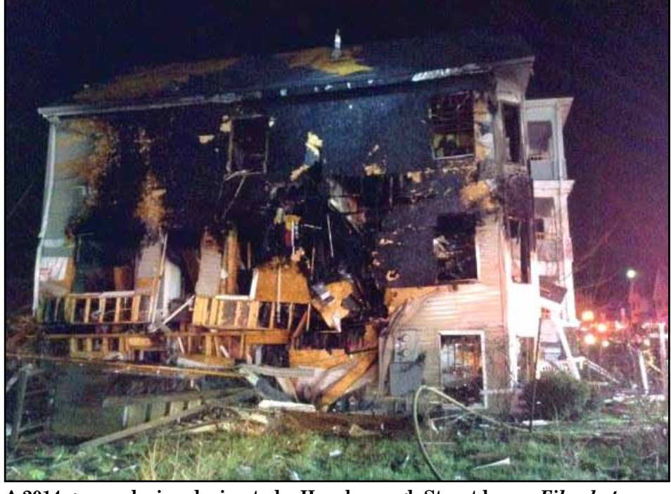
A 2014 gas explosion decimated a Hansborough Street home. File photo

They are now at an impasse over issues including pensions for new hires, changes to health care plans, and contracted work. The 1,200 union members left idle by the lockout saw