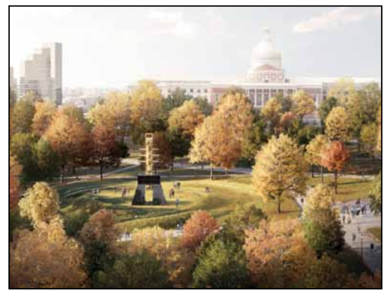
Empty Pulpit Monument

activism. Across from the beacons is a mound with an amphitheater and a seating area for the public, plus a large bridge leading to the Robert Gould Shaw and The 54th Regiment memorial across the Common. Below the bridge, a glass wall "offers a more intimate and self-reflective encounter with written and spoken texts that teach and inspire," according to the proposal.