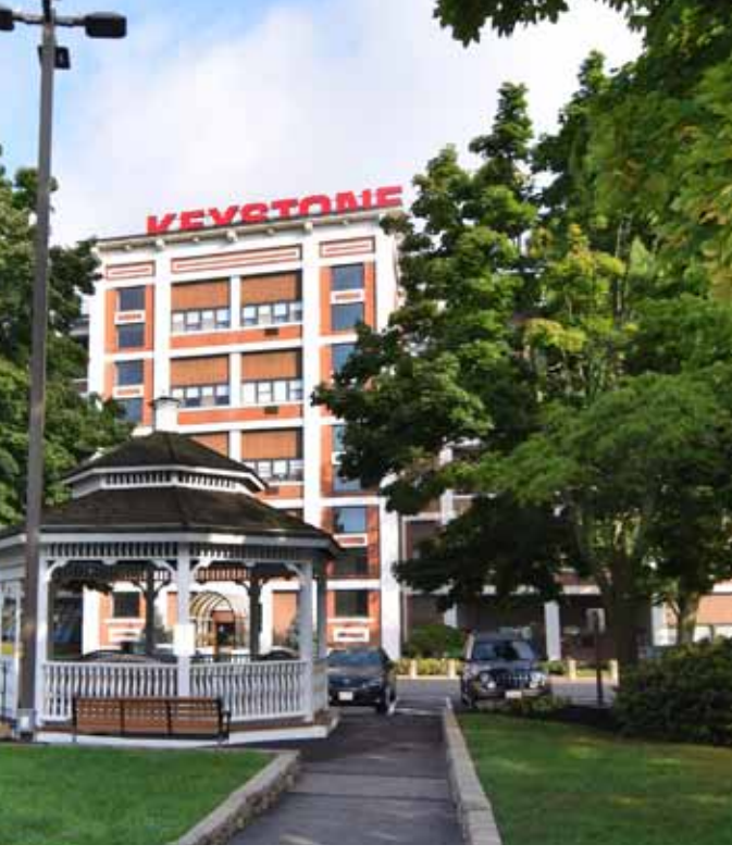
Keystone Apartments, Dorchester, MA