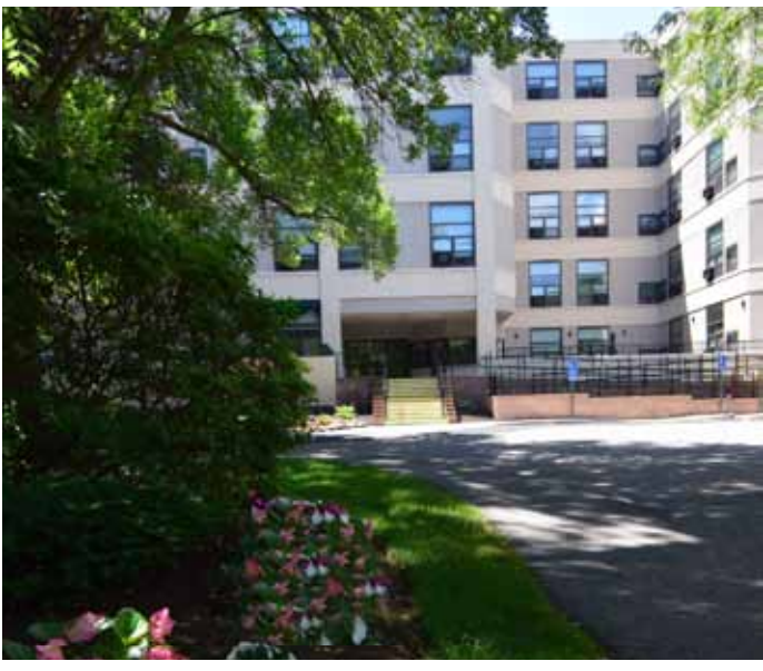
Savin Hill Apartments, Dorchester, MA